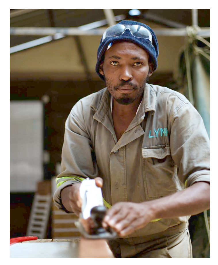
A gig worker engaging in woodwork at LYNK, an online job matching platform. Mercy Corps supported LYNK in developing platforms that links participants to jobs on construction sites, and an ecommerce platform for those with ready-to-buy products or services.

Many of the places we work are experiencing decades-long social-political conflicts, with new conflict risks emerging regularly. In other places, isolated community conflicts are common. High community tensions result in discriminatory labor markets, limited investment and economic growth, and violence. Employment programs can help reduce this tension if we support at-risk groups and individuals to access more and better employment and decrease job competition; bring together different nationalities or ethnic groups to train and work together; and work to enhance workers' representation and improve transparency around labor market dynamics.